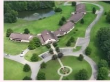
Our Lady Queen of Peace Retreat Center

Learn more online at www.memphiscursillo.com