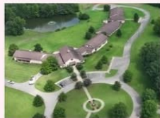
Our Lady Queen of Peace Retreat Center