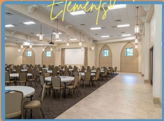
CONSTRUCTION OF A FELLOWSHIP HALL